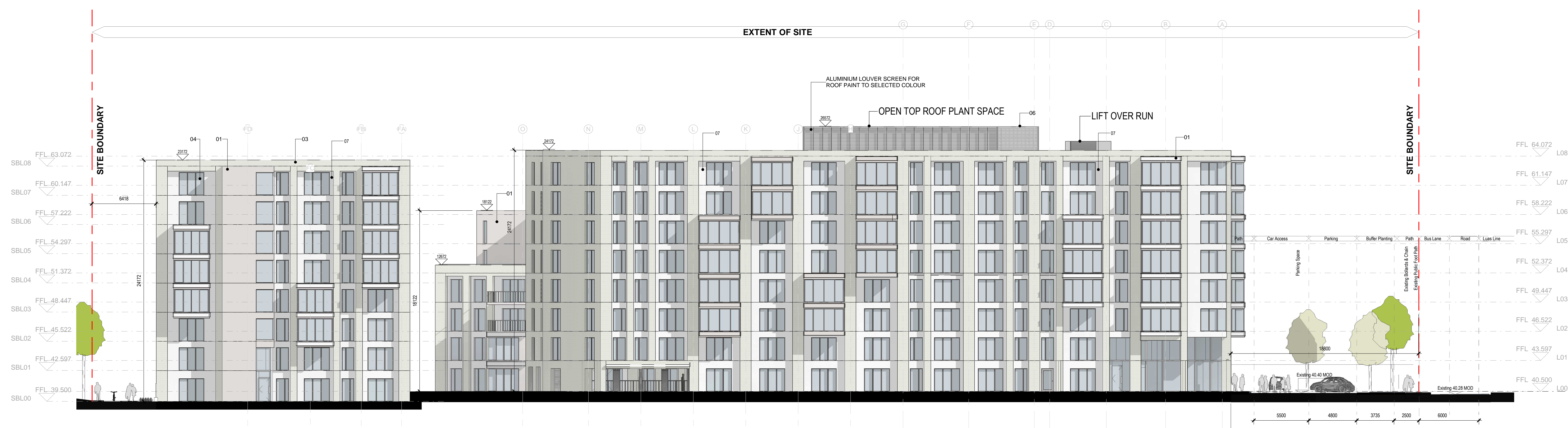
2 Elevation - East 1 : 200