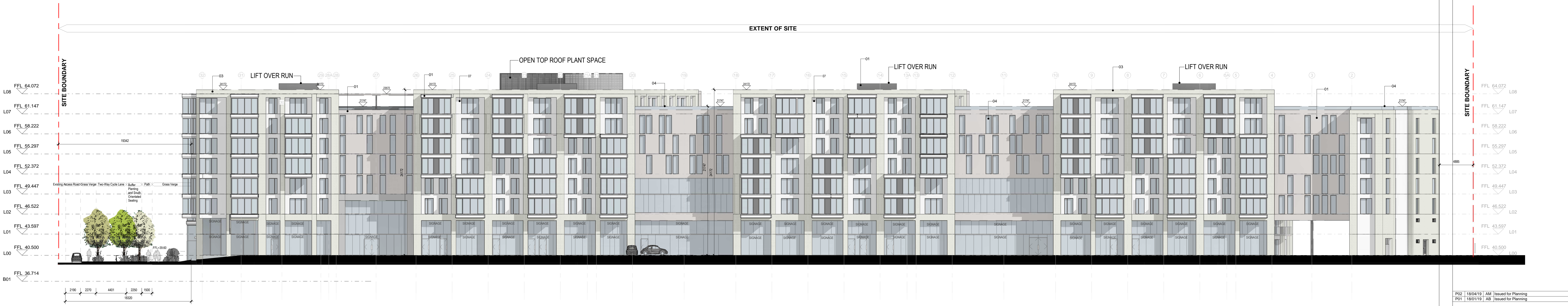
1 Elevation - North 1 : 200